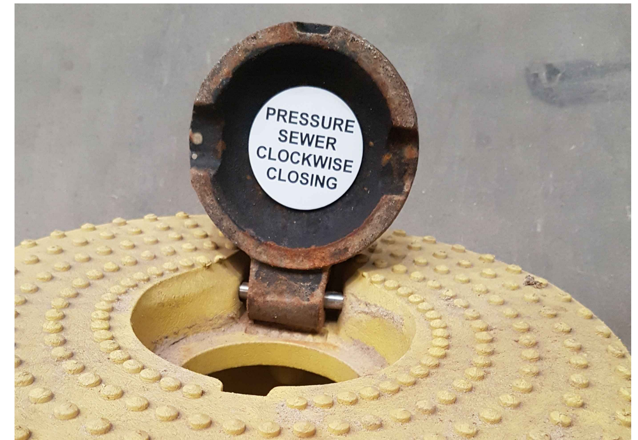
FIGURE A - PRESSURE SEWER NAMEPLATE FIXED TO NON-TRAFFICABLE VALVE COVER

LABEL - CIRCULAR CORROSION RESISTANT PLATE, (316 S/S OR TRAFFOLYTE) FIX WITH MASTIC ADHESIVE TO UNDERSIDE OF VALVE COVER - APPLY MASTIC TO WHOLE LABEL AREA. SIZED TO SUIT UNDERSIDE OF VALVE COVER LID (MIN 75MM DIA).